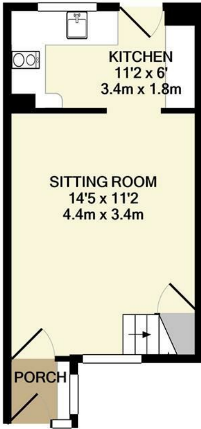
GROUND FLOOR APPROX. FLOOR AREA 239 SQ.FT. (22.2 SQ.M.)